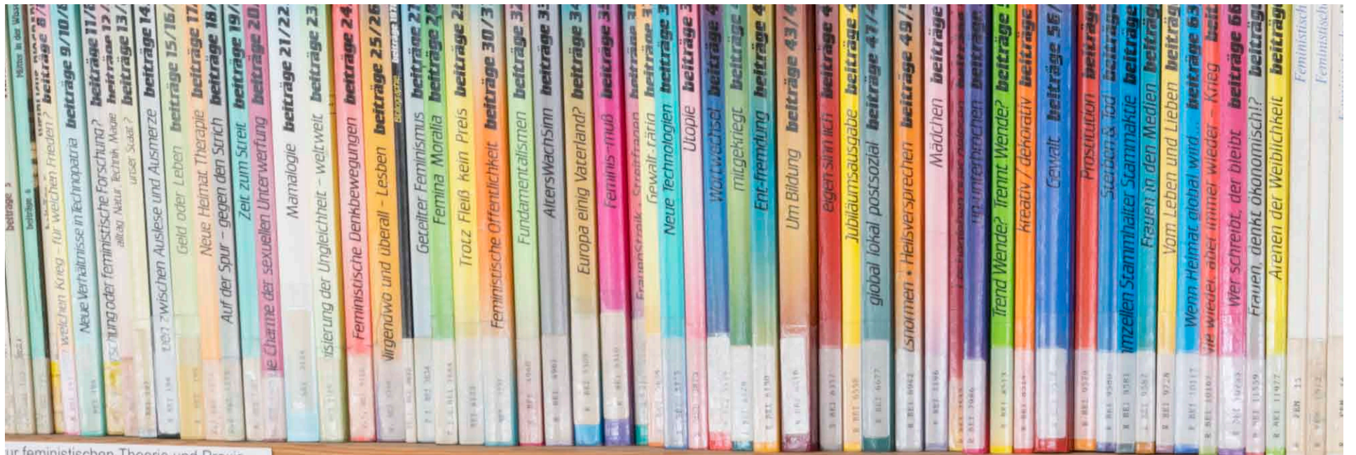
ur feministischen Theorie und Praxis